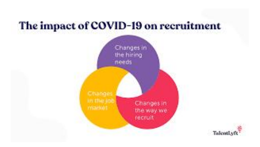
Figure 1. Impact of COVID in recruitment

labour rules, particularly the ILO Ongoing Professional development Convention, is critical.