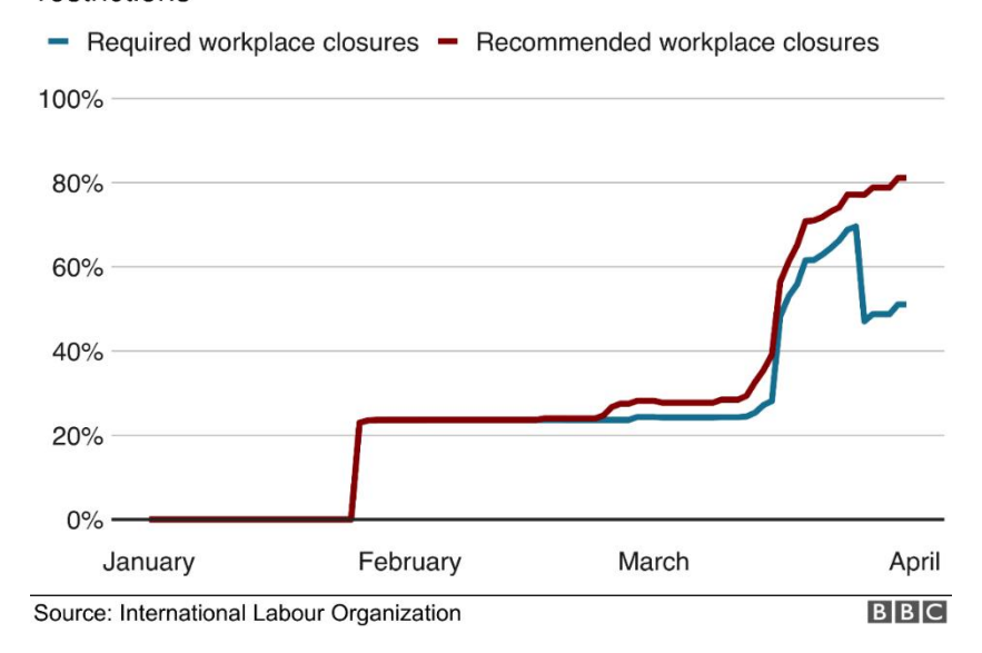
Figure 3. How employment has been affected worldwide

Share of global workforce living in countries with workplace restrictions