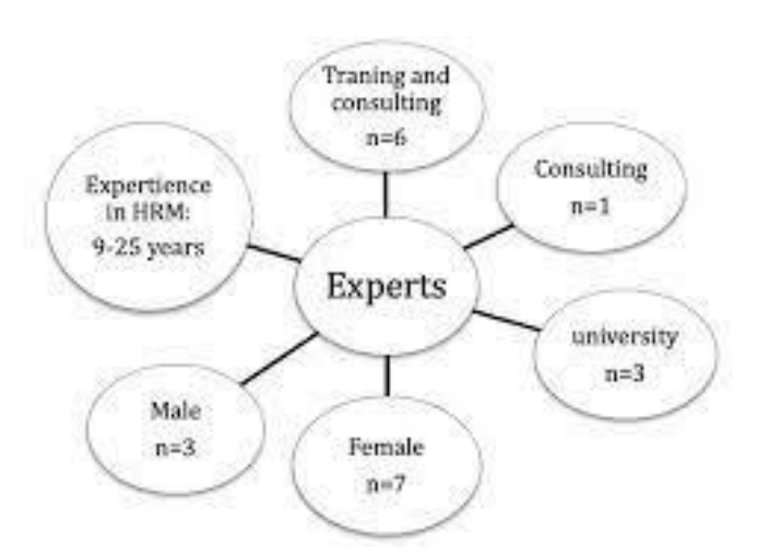
Figure 2. Impacts of pandemic in HRM functions

The 2020 pandemic resulted in numerous employment during the early forced shutdown and confinement times, as enterprises lost up to 90% of their earnings in some circumstances. Companies, in particular, were forced to cancel the majority of their operations, which were their major source of income.