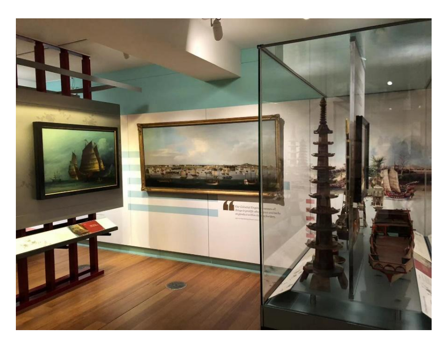
Figure 21. The exhibition space. 2020, taken by author.

The interpretation of the meaning that these two paintings produce cannot be divorced from the museum context once they have been turned from merchandise to exhibits. The Traders gallery mainly demonstrates the history of English East India Company, taking time, nation as well as type of commodity as clues. In the section illustrating its trade with China in the 19<sup>th</sup> century, these two paintings are displayed on the wall. It is clear that the current way of display primarily focuses on the content of the paintings: The port view could be seen as windows, through which we could understand how trade happened and why the commodities in the showcases can appear in front of us; The Red Ensign's wave serves as a clear reminder of the Sino-British commerce theme; Many objects in the showcases also appear in the paintings, such as the model of pagoda and varying types of watercraft, making it easier for audiences to understand other independent exhibits as well.