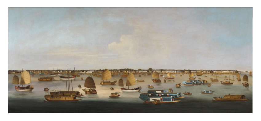
Figure 17. A View of Henan (Honam), painted by Chinese school. ca. 1840

Source: https://www.sohu.com/a/259116024_650077