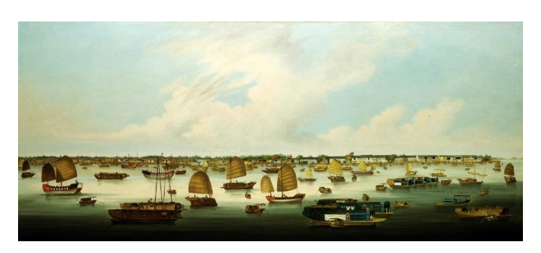
Figure 2. Shipping in the Pearl River off Honam Island, Canton , painted by Chinese school in 19<sup>th</sup> century.