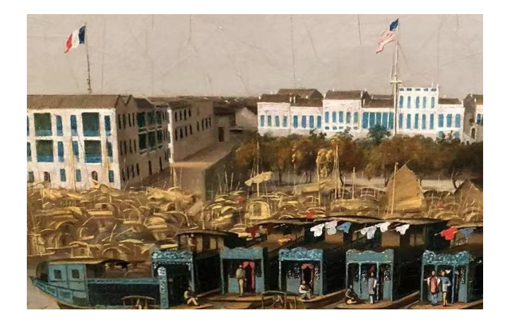
Figure 20. Shamian area, American garden with stone wall on the left, from Shipping off Canton , taken by author

It is challenging to determine when Shipping off Honam Island was created because the architectural on Homan Island are not well-known. Nevertheless, since its artistic style is similar with that of Shipping off Canton , it is reasonable to speculate that the dates of their creation will not vary too much. Also, if this painting was painted in Youqua's studio, it must have been completed after 1840, when Youqua began offering his works for sale in Canton.