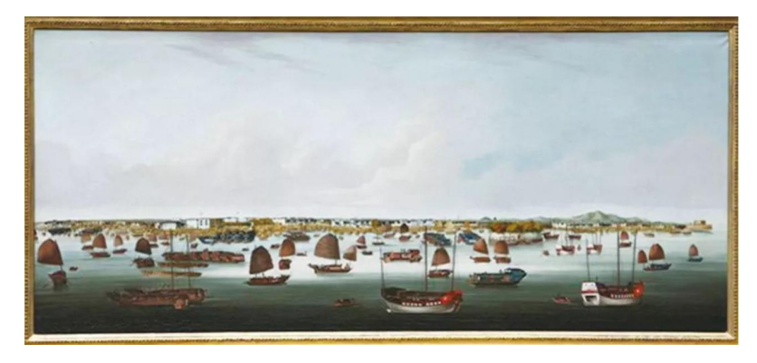
Figure 16. Picture of General View on Guangzhou City, painted by Youqua. ca. 1845