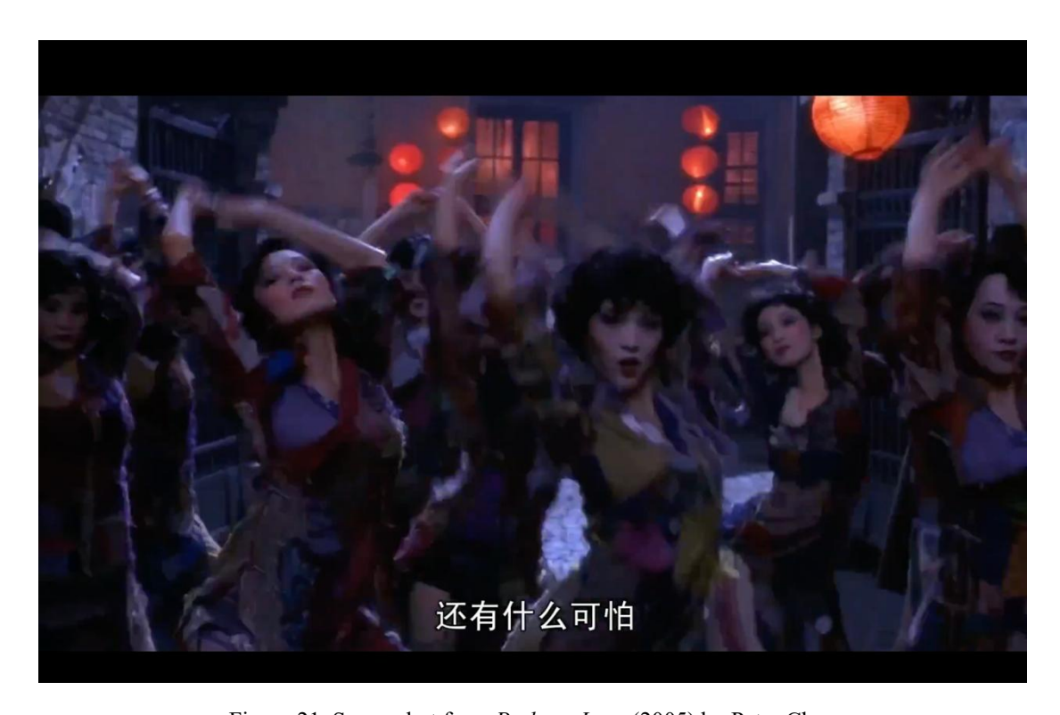
Figure 21. Screenshot from Perhaps Love (2005) by Peter Chan

The film employs a diverse range of montage techniques in order to effectively tell its story. Among these techniques are cinematic crossovers and parallelism, which are used to great effect throughout the film. One particularly successful aspect of the movie's editing is its ability to distinguish between dance sequences and plot development by editing the frames in sync with the music's rhythm. This attention to detail and careful consideration of the relationship between visuals and music make for a truly engaging and immersive cinematic experience.