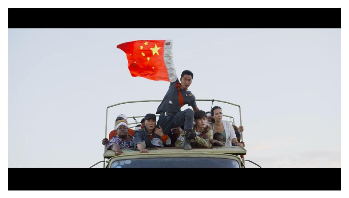
Figure 5. Screenshot from Wolf Warriors II (2017) by Jing Wu

This film evokes a shared spiritual longing that resonates with the Chinese populace. According to the director and lead actor, Wu Jing, during a talk show, "A passport from the People's Republic of China may not necessarily grant access to all locations, but it does possess the power to bring its holder back from any destination," Which demonstrates the unifying force of the Chinese nation (Zhang, 2017). The film Wolf Warriors II (2017) effectively portrays the remarkable solidarity of the Chinese people through compelling scenes. One such example is the courageous rescue mission led by Leng Feng, which highlights the selflessness and unwavering commitment of Chinese citizens during times of crisis. Furthermore, the collective efforts of the stranded Chinese nationals in the movie bear witness to the shared sense of responsibility and resilience that unite the Chinese populace. Overall, the film serves as a powerful tribute to the unbreakable spirit of the Chinese nation.