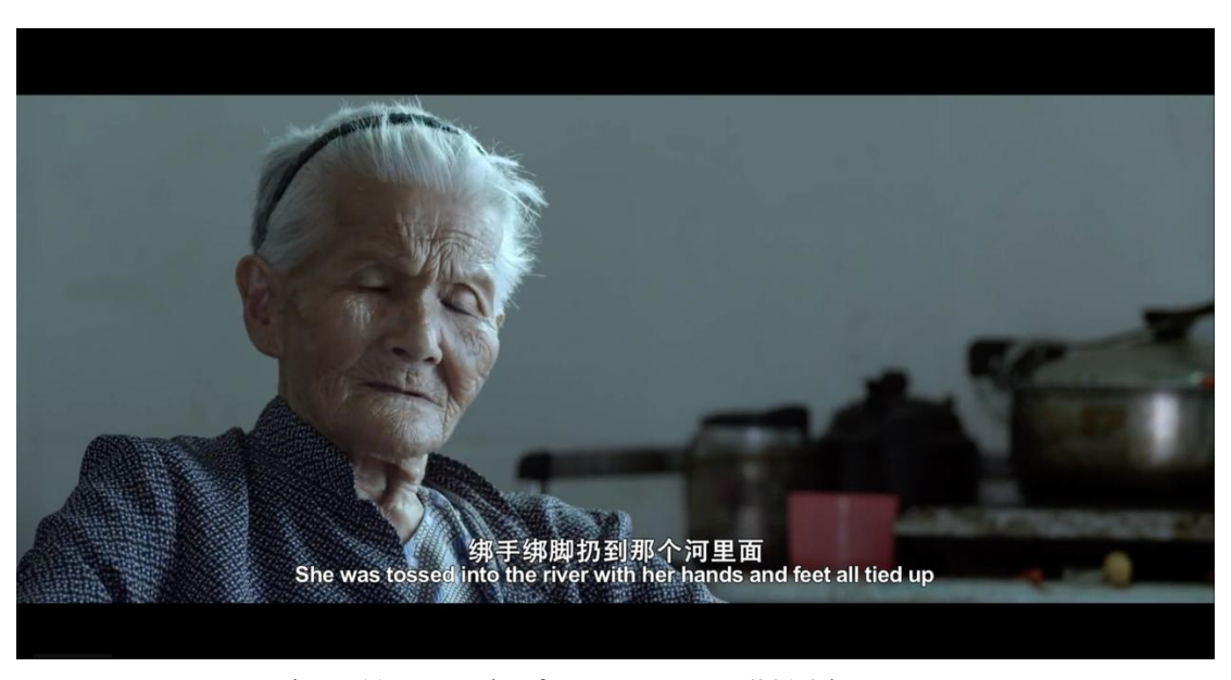
Figure 11. Screenshot from Twenty-Two (2017) by Ke Guo

In an in-depth interview with a journalist, they said that when the Japanese would see the girls, they would be taken and raped. They were afraid to run away during their capture. If discovered, they would be beaten to death or thrown into the river with their hands and feet tied (see Figure 11). Even if they were lucky enough to return to their families, the persistent physical abuse they received from the Japanese forces prevented them from leading normal lives (see Figure 12). It can be observed that they in question have relatively little flesh covering their bones, which gives them a very slender appearance. Additionally, they use crutches to aid in their mobility (see Figure 13). The Journal of Gerontological Social Work has published an article stating that "comfort women suffered substantial physical harm during their captivity, including contracting sexually transmitted diseases, failure to treat these diseases, abortion, forced abortions, and forced sterilisation (Park, et al., 2016)."