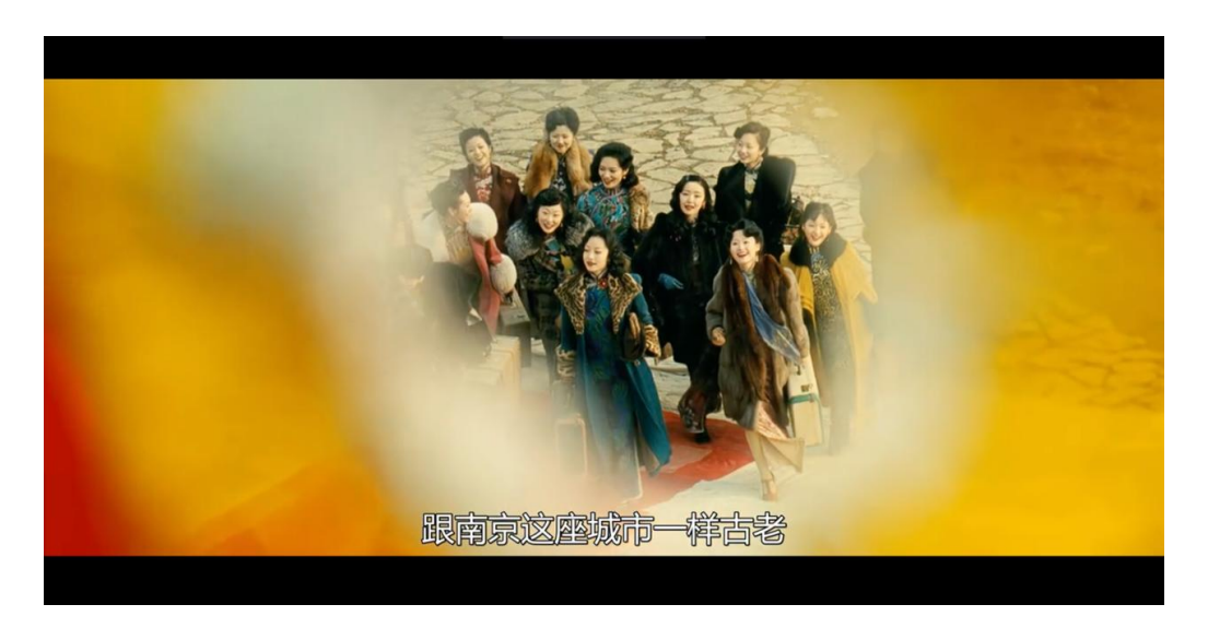
Figure 18. Screenshot from The Flowers of War (2011) by Yimou Zhang