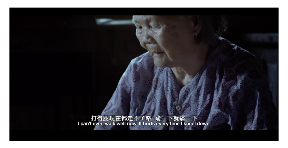
Figure 12. Screenshot from Twenty-Two (2017) by Ke Guo