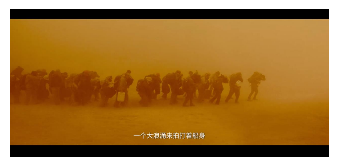
Figure 6. Screenshot from Home Coming (2022) by Xiaozhi Rao