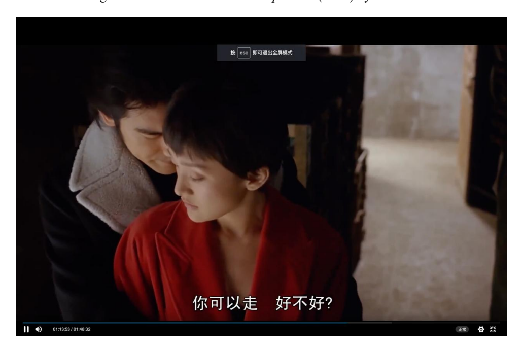
Figure 23. Screenshot from Perhaps Love (2005) by Peter Chan