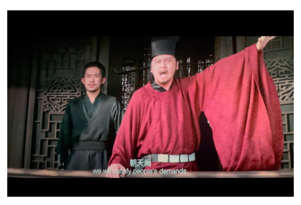
Figure 4. Screenshot from Full River Red (2023) by Yimou Zhang

The title of the movie is derived from a poem called Man Jiang Hong—Raging Hair , penned by the esteemed anti-Japanese hero Yue Fei during the Song dynasty. Yue Fei, a general during that era, fought against the Jin dynasty while symbolizing the national sentiment prevalent at the time (Zhou, 2004). This historical context lends the title a profound and meaningful significance, elevating it beyond its surface-level interpretation. The film's greatest villain, Qin Hui's double, recites the entire lyric unpassionately (see Figure 4), thus bringing the film to its climax. Full River Red (2023) combines traditional Chinese ethnic culture with modern Western elements, paired with traditional Chinese cultural Yu Opera and musical instruments, to export Chinese characteristic ethnic culture better.