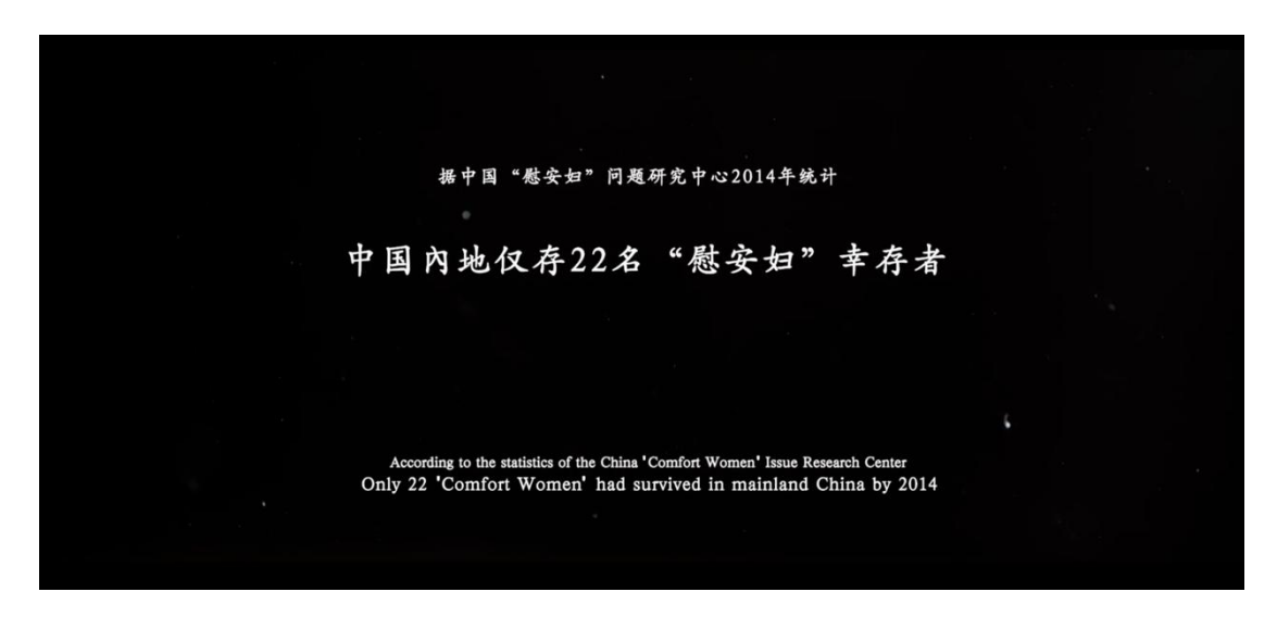
Figure 14. Screenshot from Twenty-Two (2017) by Ke Guo

Under the influence of post-colonialism, Chinese film has gradually taken an open attitude, blended diverse cultures different cultures and presented an increasing number of international elements. Examples include the films The Flowers of War (2011) and Perhaps Love (2005). The films have international elements regarding religion and presenting style, respectively. The Flowers of War (2011) offers a fictionalized take on the Nanjing Massacre of 1937, delving into the intricacies of human emotions and experiences amidst this unfortunate historical incident. Twelve prostitutes from the Qinhuai River seek refuge from the Japanese madness in a Catholic chapel with an American flag. The rose-stained glass windows in the church are particularly significant in the film's depiction of the church's interior design (see Figure 15).