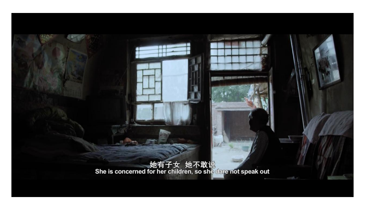
Figure 9. Screenshot from Twenty-Two (2017) by Ke Guo

Psychiatry Investing (2019) has previously confirmed that these oppressed women experienced severe trauma during their forced servitude by the Imperial Japanese Army, including widespread rape and physical torture. Because of trauma, they displayed a high prevalence of mental illnesses following the events, especially post-traumatic stress disorder (PTSD). Survivors experience lifelong feelings of guilt and shame, as well as dealing with problems of emotional regulation and impulse control (American Psychiatric Association, 2013).