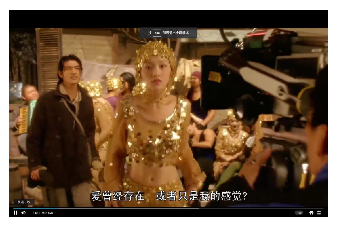
Figure 24. Screenshot from Perhaps Love (2005) by Peter Chan

In conclusion, post-colonialism has influenced and been closely linked to the development trend of Chinese film in terms of its desire to break free from colonial control over cultural hegemony, emphasis on its own independence and development, resistance to colonial subjugation, and openness to accepting different cultures. This has encouraged Chinese film to focus more on exporting national culture with distinctive Chinese aspects, emphasising the nation's unity, exposing bravely the harm done by colonial aggression, and enabling more and more foreign elements to permeate it.