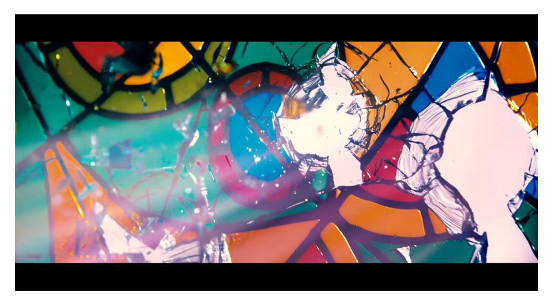
Figure 16. Screenshot from The Flowers of War (2011) by Yimou Zhang