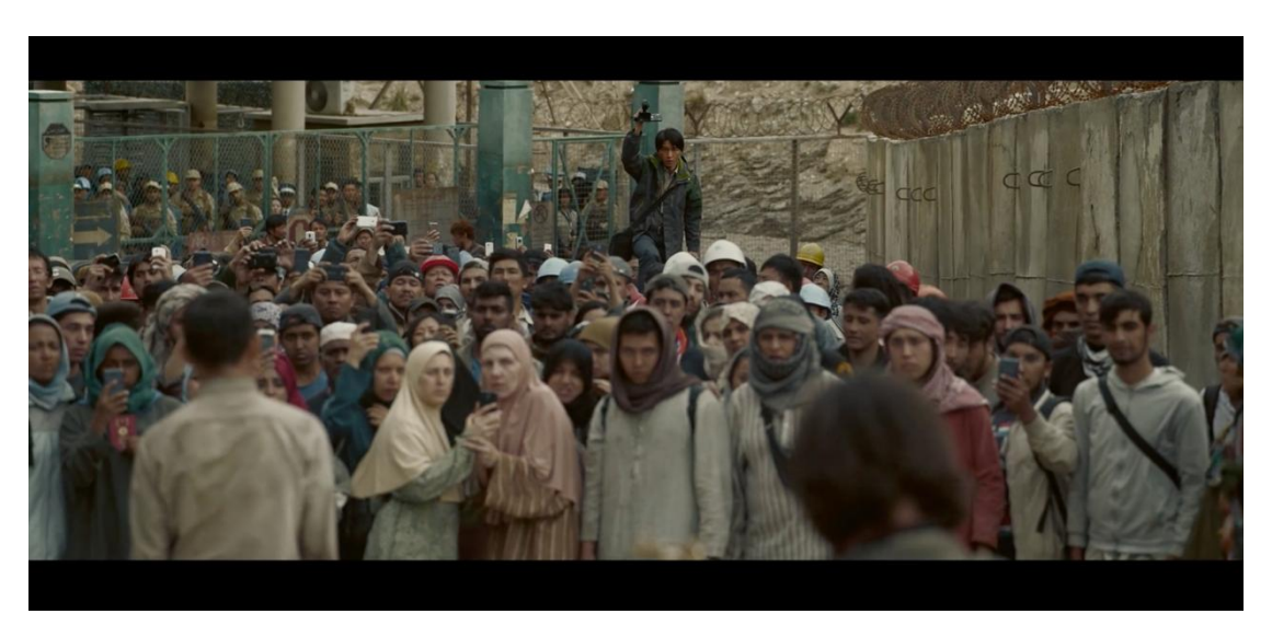
Figure 7. Screenshot from Home Coming (2022) by Xiaozhi Rao

The film portrays the valiant efforts of Zong Dawei, a seasoned diplomat, and Cheng Lang, a newcomer to the Foreign Ministry, as they guide and safeguard their compatriots through perilous war zones and barren deserts using only their bare hands. Together, they fearlessly shield Jong Da Wei from the lethal gunfire of the insurgents. As stated by Zheng & Yang in the Chongqing Morning Post Media, "Home Coming (2022) embodies the spirit and power of collectivism, where the individual is united with the collective, highlighting the cultural representation of collectivism that upholds group identity. It presents the cultural significance of Chinese community spirit and values (Zheng & Yang, 2022)."