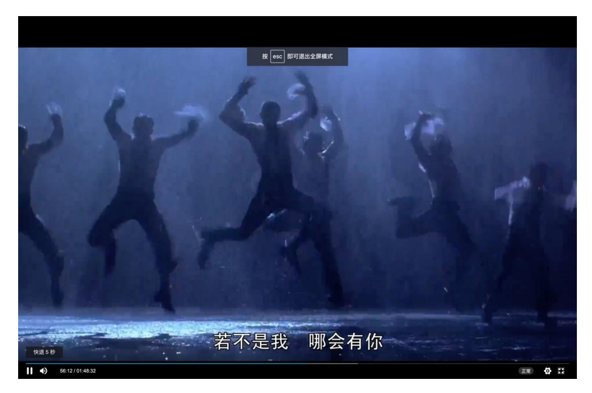
Figure 20. Screenshot from Perhaps Love (2005) by Peter Chan