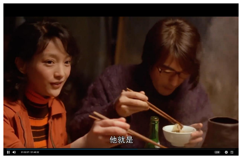
Figure 22. Screenshot from Perhaps Love (2005) by Peter Chan

One is the tale of a couple fell in love in Beijing ten years ago (see Figure 22). The second is the tale of their collaboration on a film in Shanghai ten years later (see Figure 23). The third is the story of the studio owner, Xiao Yu, and Zhang Yang in the play-within-a-play (see Figure 24). The three levels can be abbreviated as the story of the past, the story of the present, and the story of the play, respectively. The film takes a very contemporary approach to time and space. The audience feels a powerful psychological impact due to the director's flexible use of parallel montages with images swinging back and forth from a decade. The Flowers of War (2011) and Perhaps Love (2005) reflect the growing diversity of international elements being incorporated into Chinese cinema under the influence of post-colonial openness and tolerance of different cultures.