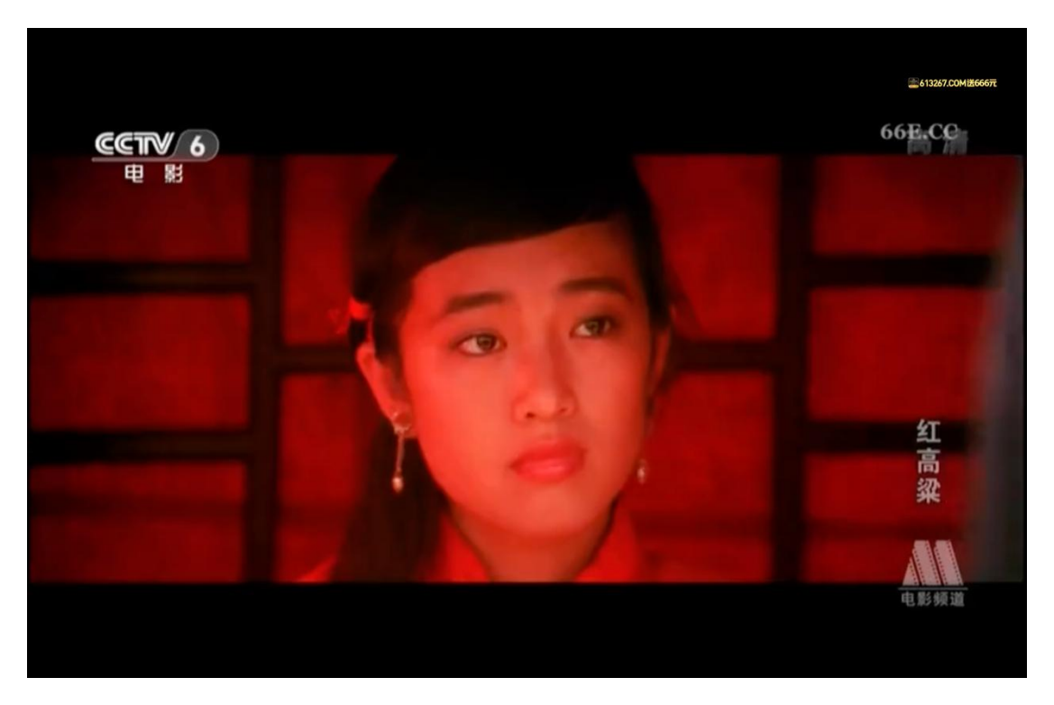
Figure 1. Screenshot from Red Sorghum (1987) by Yimou Zhang

Chinese wedding customs are reflected in the film, in which the bride, Jiu Er, is dressed in red, wearing a red headdress, red dress, red embroidered shoes and a red veil in a red palanquin (see figure 1). Red has traditionally been revered in China and is frequently associated with positive and joyful things since it is seen as a colour of power, hope, celebration, and fertility (Stuart, 2020). The film uses red to bring out this auspicious and festive connotation.