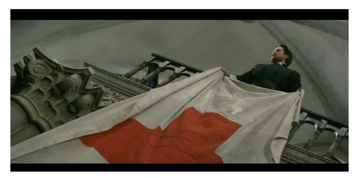
Figure 19. Screenshot from The Flowers of War (2011) by Yimou Zhang

At the end of the film, he leaves Nanjing with tears in his eyes as he drives. His tears are shed for the prostitutes of the Qinhuai River who were captured by the Japanese army in the guise of schoolgirls, for the girls who escaped against all odds, and for the tragic fate of the people of Nanjing and the entire Chinese nation who were slaughtered by the Japanese army. The Flowers of War (2011) uses the elements of the church and the priest while skillfully combining Western religion with the Chinese historical background.