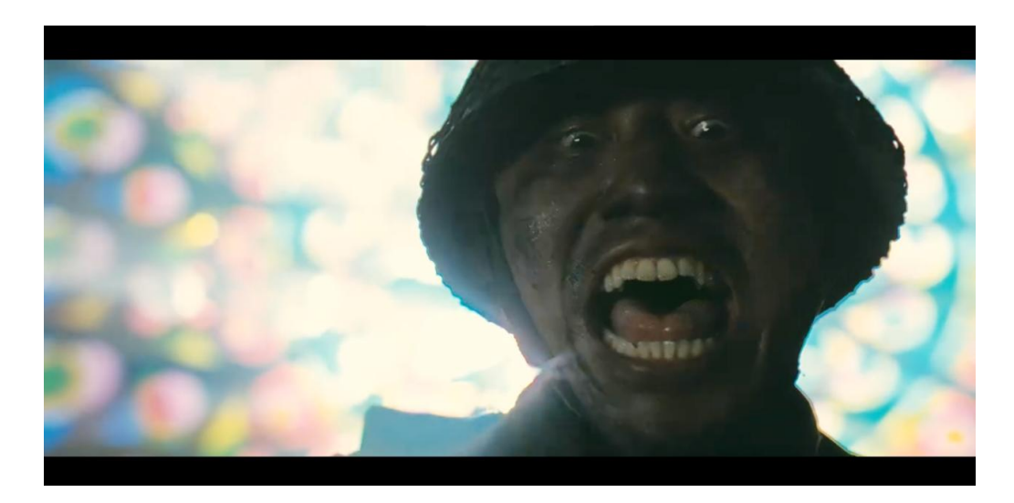
Figure 17. Screenshot from The Flowers of War (2011) by Yimou Zhang