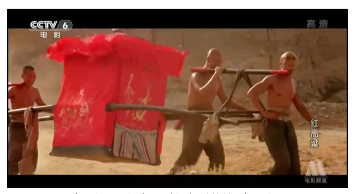
Figure 2. Screenshot from Red Sorghum (1987) by Yimou Zhang

This film features many folk songs and suona folk music, such as The Song of the Upside-Down Sedan Chair and The Song of the Wine God , etc. There are four types of songs: mountain songs, work songs, chanty and minor (Huang, 1989), and there is a great deal of fusion going on within the film Red Sorghum. Brewing of alcohol is the main event of this film, and it is depicted at every step of the process, from fermentation to honouring the god of wine. In particular, the ritual of honouring the god is shown, with the brewery workers standing in front of a portrait of the god of wine, Dukang, singing a song about this, while drinking and throwing bowls (see Figure 3). The toasting of the god of wine is another fictional folk tale that has its origins in ancient Chinese rituals (Nan, 2022). Red Sorghum (1987) effectively displays the different cultural meanings of Chinese distinctive ethnic culture by including much of the traditional Chinese folklore.