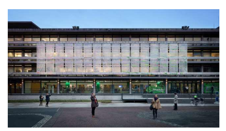
Figure 2. The prototype installation of Photosynthetica created by EcoLogic Studio, covering the first and second floor of the historic building in Dublin

The architects demonstrated a prototype of the system at the 2018 Climate Innovation Summit in Dublin in early November. The installation spanned the first and second floors of the main facade of the Printworks building in Dublin Castle. Like other EcoLogicStudio projects, the curtain is a form of biomimetic, a design that copies the structures and processes of nature.