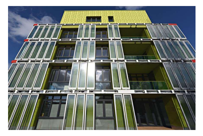
Figure 1. Bioreactive façade with algae filled panels, Damir Beciri

help reduce and eliminate 2.5 tons of CO2 emissions from buildings every year. Therefore, this remarkable concept of sustainable energy is capable of creating a cycle of solar thermal energy, geothermal energy and capturing biomass using a bioreactor view.